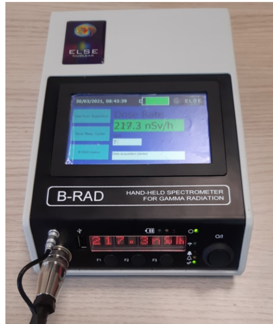
B-RAD main unit