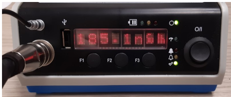
B-RAD secondary LED display