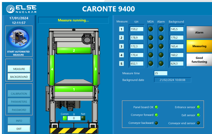
CARONTE software interface