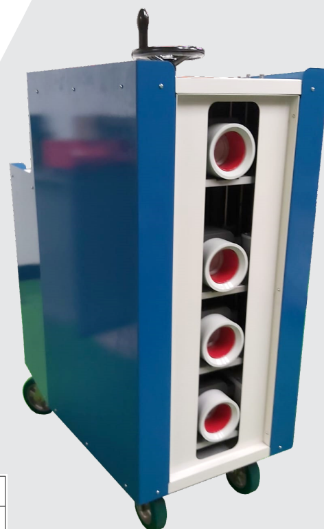
EASYSCAN mobile station

EASYSCAN operates with no moving parts, as it is a totally manual system. This avoids any risk generated by engine-related issues and helps in reducing residual risks caused by improper use.