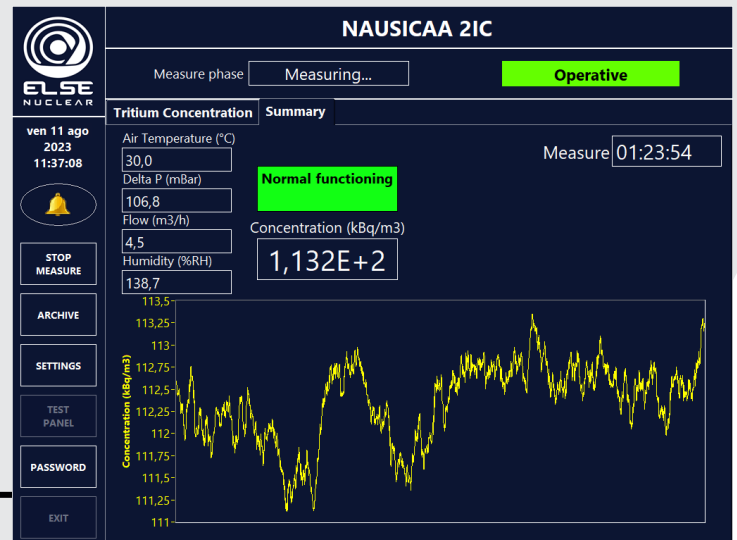
NAUSICAA 2IC user interface