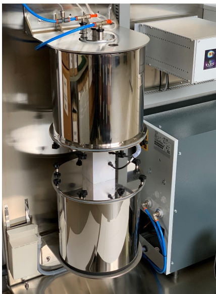
Twin 10 l ion chambers