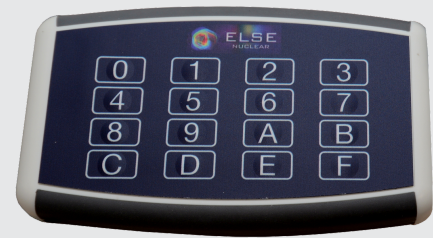
TOUCHKEY2 external keyboard