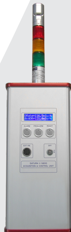
SATURN II version with built-in ALU