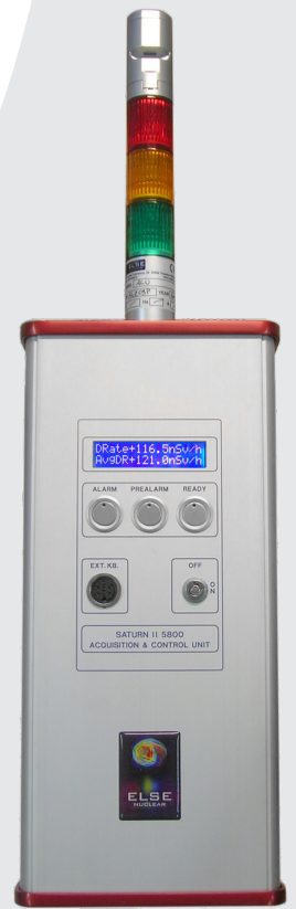
SATURN II version with built-in ALU