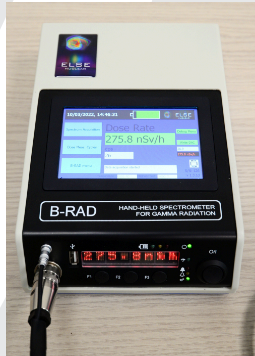
B-RAD main unit with double display